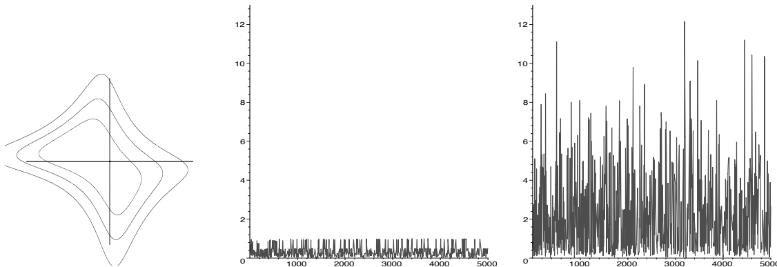
Figure 3: Results for birational maps that reduce to permutations over finite fields \mathbb{F}_p^2 . Left : Part of the real phase portrait of a planar birational map with a rational integral, showing the orbits of the initial conditions (1, 0) , (1, 1) and (1, 2) . Middle : Lengths of the orbit of (1, 1) in \mathbb{P}(\mathbb{F}_p^2) , divided by the Hasse-Weil bound (20), plotted as a function of p for the reduction of a one-parameter family of birational maps in the case of the integrable parameter value \epsilon = 0 , whose phase portrait was shown at left. Right : Normalized length plot again for (1, 1) as for the Middle figure but now for a non-integrable perturbation \epsilon = 10^{-4} . Whilst the phase portrait of this perturbation is virtually indistinguishable from the Left figure, the generic orbit lengths are now well in excess of the Hasse-Weil bound (there is no contradiction since the invariant KAM curves in the perturbation are not algebraic curves).